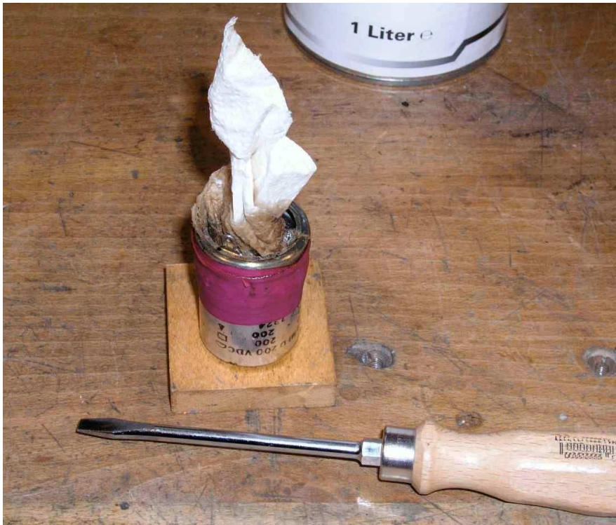
Picture 5 ... and wiping it clean