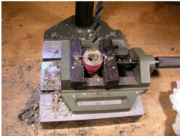
Picture 1 - Drilling

First step was to remove the electrolyt and all content of the case (picture 1) with a drilling machine. The cap was protected with some tape for better fixing.