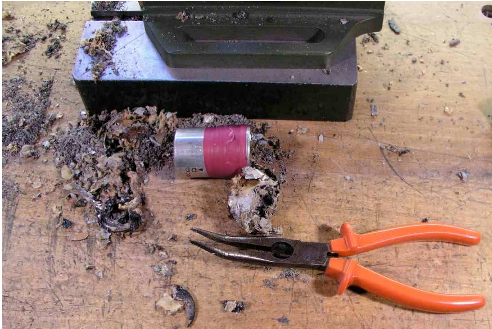
Picture 3 ... and long-nose pliers